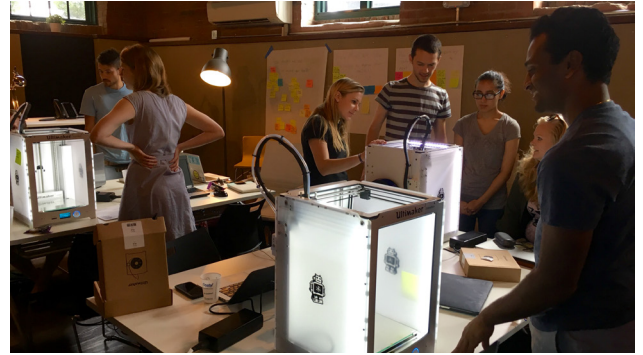
JeffDESIGN is aimed to boost innovation in the healthcare sector